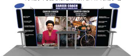
LINEAR "S" 10'x20' FULL DISPLAY KIT: LN-K-10X20-S