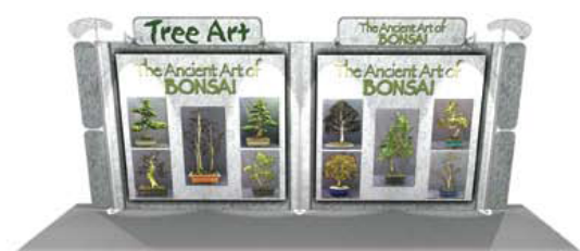
LINEAR "Q" 10'x20' FULL DISPLAY KIT: LN-K-10X20-Q