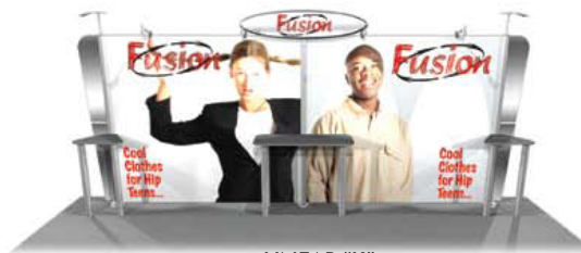
LINEAR "K" 10'x20' FULL DISPLAY KIT: LN-K-10X20-K

Standard production time line for detachable graphics for fabric display (50-100 sq. ft.) is 7-10 days.