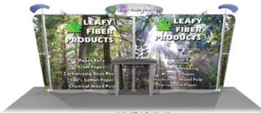
LINEAR "M" 10'x20' FULL DISPLAY KIT: LN-K-10X20-M