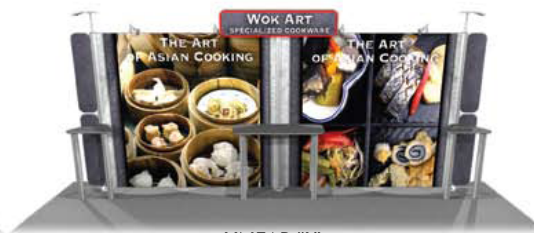
LINEAR "L" 10'x20' FULL DISPLAY KIT: LN-K-10X20-L