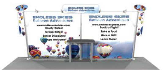
LINEAR "R" 10'x20' FULL DISPLAY KIT: LN-K-10X20-R