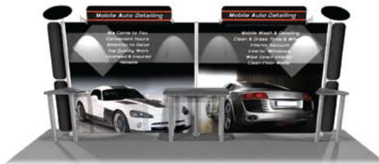
LINEAR "O" 10'x20' FULL DISPLAY KIT: LN-K-10X20-O