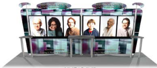
LINEAR "N" 10'x20' FULL DISPLAY KIT: LN-K-10X20-N