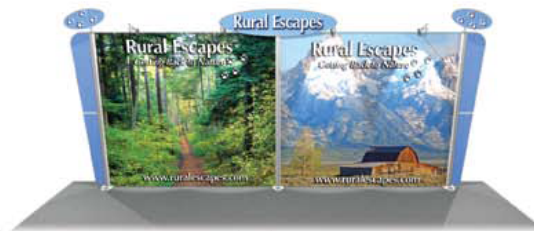
LINEAR "P" 10'x20' FULL DISPLAY KIT: LN-K-10X20-P